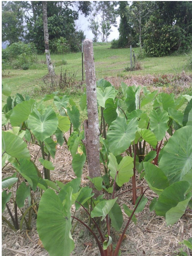
Plate 5: Taro crop with traditional PNG digging stick

Hmong farmer: [Hmong people] like growing rice plants because they prefer homemade rice ... in Innisfail my mum used to grow rice ... [but] there's plenty of birds coming to eat the seed. Every morning, my mum used to go to care them ... but it doesn't work ... Back [in Laos] there are also some ants that also eat the seeds that you plant but we have a natural poison to kill [them] ... it grows underground and you pull it out and squash it and cook with oil ... in a few days, all the ants are gone.