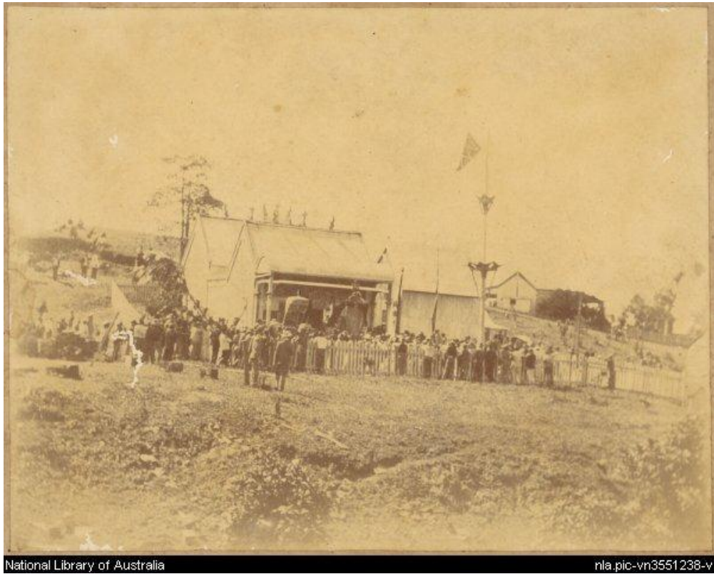
Plate 2: Welcome at the Joss House, Innisfail, Queensland 1890-1910 ( http://nla.gov.au/nla.pic-vn3551238)