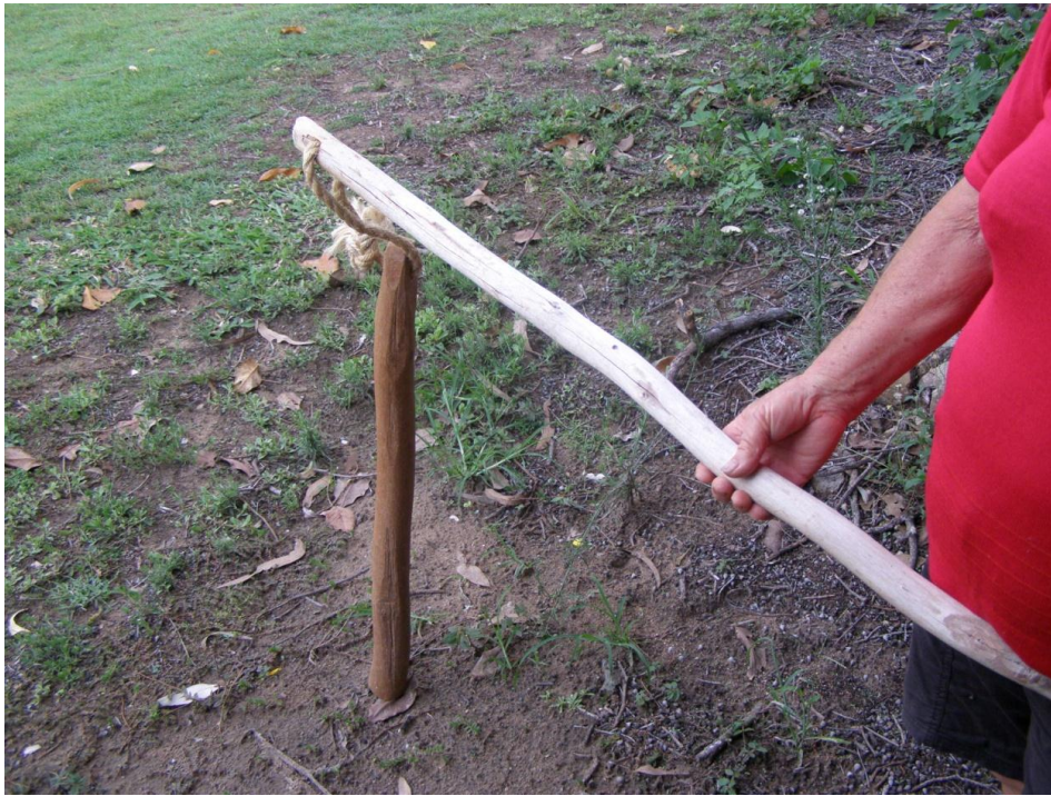
Plate 4: Buckwheat thresher still in use by FNQ Italian farmer

Papua New Guinean farmer: I put the gardens [in] for my family, but [there] is plenty for us, so I decided to sell. Because there are many people who love these vegetables too, but don't have land, or [a] block ... I grow [the vegetables I do] because that's my main diet.