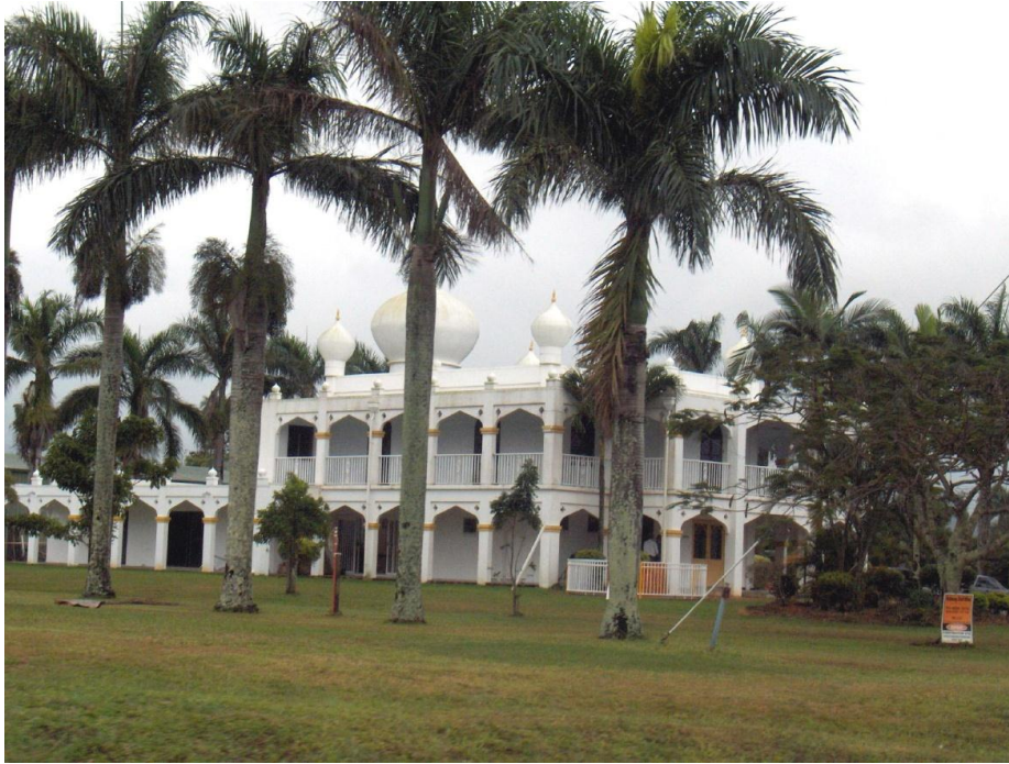
Plate 1: Sikh temple Gordonvale

The latter phase of the research was interrupted by Cyclone Yasi, however, which necessitated a broadening of the initial research categories. The Hmong and Sikh interviews set up the week Yasi struck could not be undertaken due to damage along the coast south of Cairns. For this reason the ethnic categories of the study were broadened to include shorter-term migrant groups in less affected areas. A list of the farmers interviewed over the course of the project is presented in Table 2.