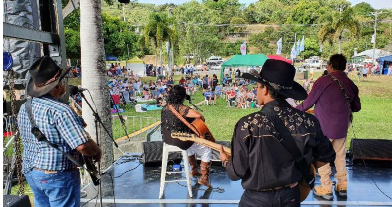
Cape York and Torres Strait Islands Regional Arts Showcase

Showcase the value of our regional artists through leveraging strong traditional and non traditional partnerships, providing legacy outcomes.