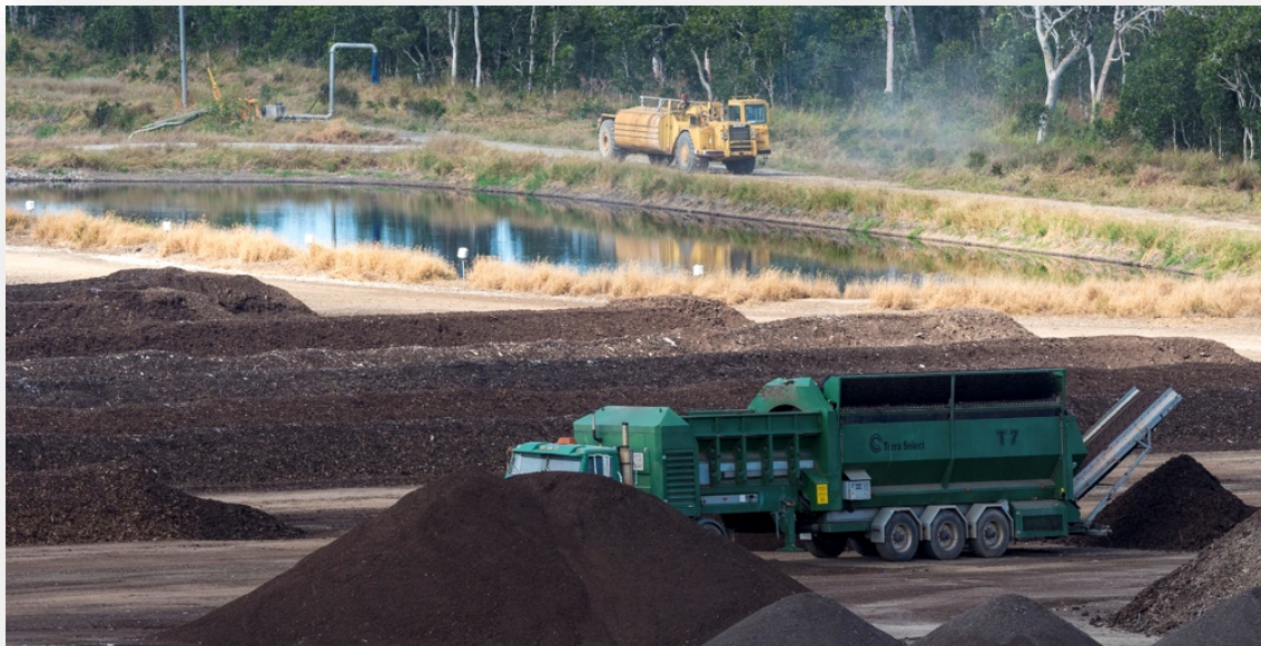
Shark Recycling Composting Facility in Bibbohra

Far Northern Queensland regional growers experience challenges with water usage, soil quality, agricultural output and run-off to the Great Barrier Reef. Local banana farmer and owner of Shark Recyclers, Peter Inderbitzin discovered using compost, (created from green-waste stock piles at Cairns Regional Council transfer station) resulted in a 60% reduction in use of chemical fertiliser, 35% increase in production, a 9-fold increase in organic matter, a 19% saving in energy cost and a 30% reduction in water consumption.