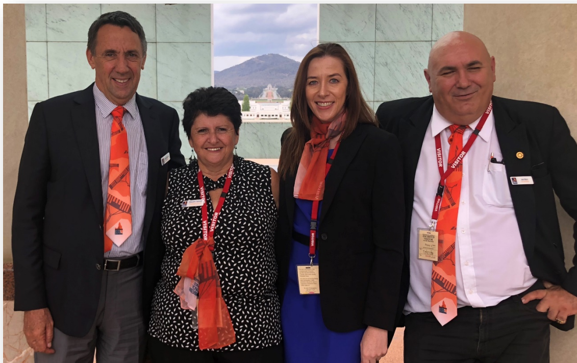
MOSSMAN MILL FUNDING ADVOCACY

It is estimated that the Precinct will create 86 new long term jobs, $80 Million per annum in industry generated revenue, with a proposed value adding of $150M per annum.