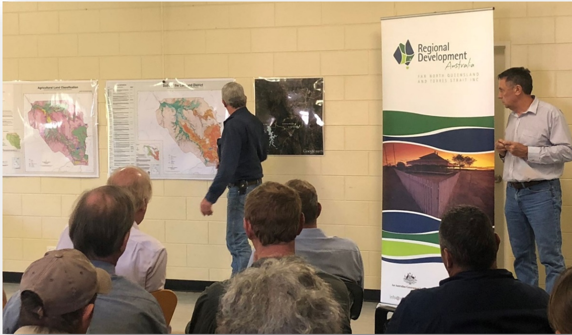
PUBLIC RELEASE OF THE LAKELAND IRRIGATION SCHEME FEASIBILITY REPORT IN LAKELAND

RDA has since met with and sent correspondence to all relevant State and Federal Ministers providing information about the project and seeking their support and entered into conversations with the Department of Infrastructure regarding its possible progression.