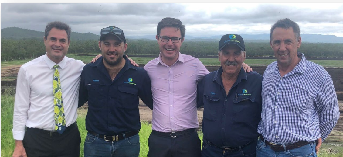
COMPOST FOR A FARMING FUTURE PROJECT FUNDING ANNOUNCEMENT

In March 2018, the Hon David Littleproud MP announced $750,000 for RDA to deliver the project.