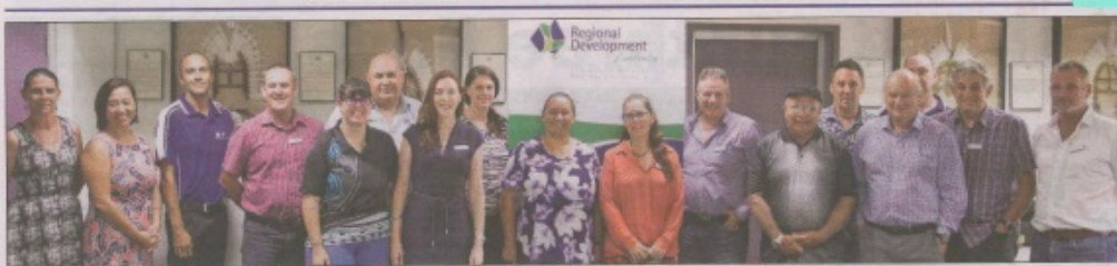
The RDA Board with community stakeholders.

The Committee attended the RDA public release of the Lakeland Irrigation Area Report at the Lakeland Community Centre and toured Red Valley Farms, an innovative, family-owned operation that supplies bananas year round.