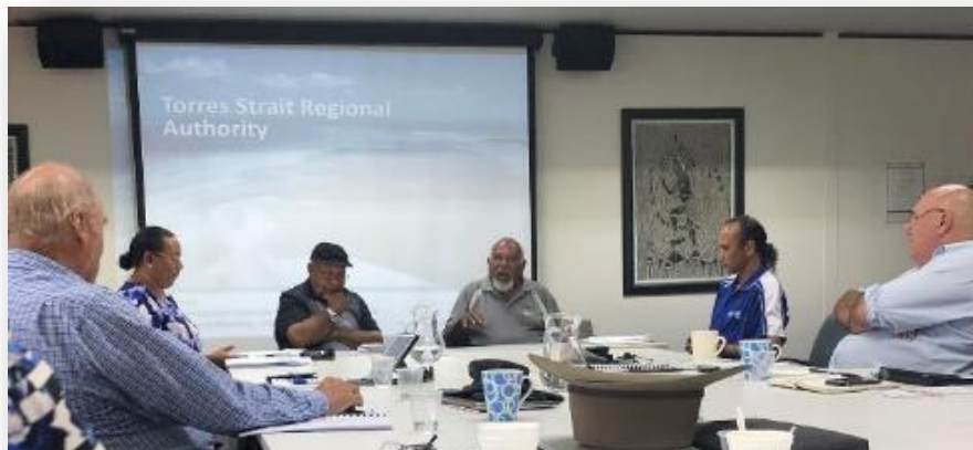
RDA THURSDAY ISLAND COMMITTEE MEETING

During the visit, RDA also met with native title groups - Gur A Baradharaw Kod Torres Strait Sea and Land Council to discuss Indigenous economic opportunities and toured the island's infrastructure.