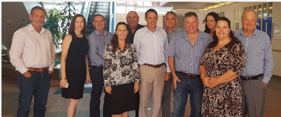
THE RDA COMMITTEE and Staff

The RDA Committee, drawn from leaders and experts from across the region, has an active and facilitative role in the community and a clear focus on growing a strong and confident regional economy that harnesses its competitive advantages, seizes on economic opportunity and attracts investment.